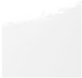
L7 polished white lacquered