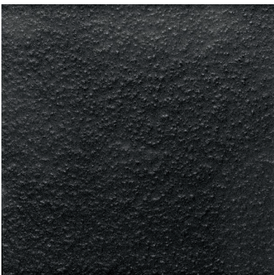
nero brillante brilliant black