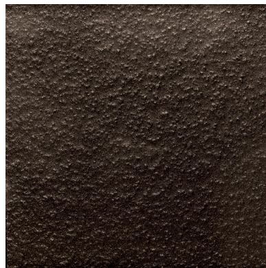
marrone brillante brilliant brown