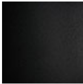
GFM73 black embossed